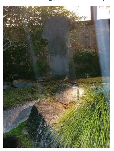
Subtle lighting in the Haiku Garden