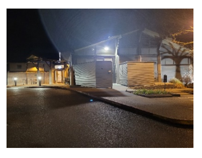
Main entry and parking lot