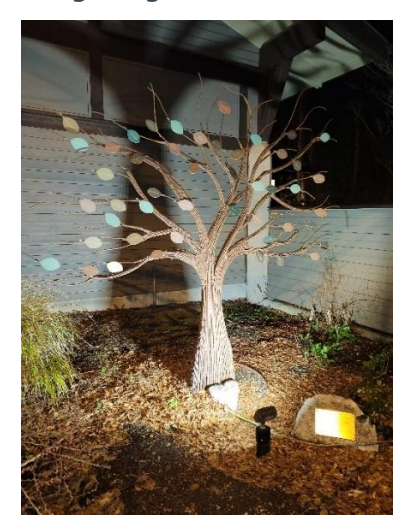
Legacy Tree honoring donors naming BPL in their estates.