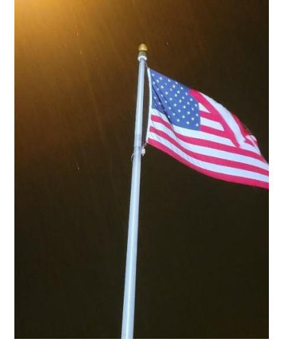
Our national flag, so it can fly 24/7