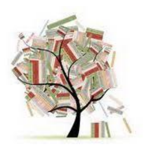
Be safe... Be well!

"A library is a cross between an emergency exit, a life-raft and a festival—a cathedral of the mind; hospital of the soul; theme park of the imagination." ~ Caitlin Moran