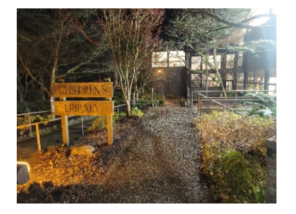
Children's Library entrance